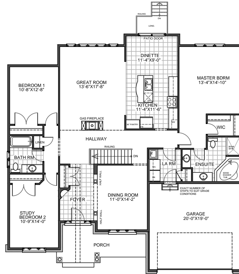
FIRST FLOOR PLAN 1937 SQFT